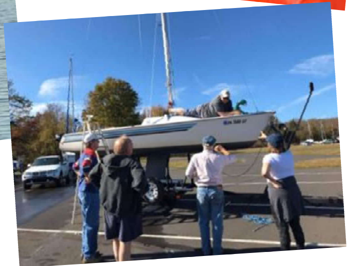
Clockwise from top left: Party tent at the ULDB ; Committee boat getting underway at the Glenn Wesley Memorial Regatta ; Scenes from haul-out weekend