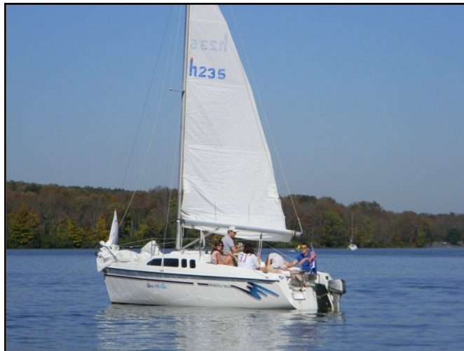
Krupa Family Sets Sail

Boats out and tucked in for the winter – how sad. But we plan to keep in contact, socialize at the various winter gatherings as much as possible to share stories and plans, and then get ready to hit the water again in the spring. In 2011 the fleet included one Hunter 170, one Hunter 18, seven Hunter 23.5's, and one Hunter 290. We hope to have even more fleet members next year, and to gather as a fleet for casual “convoy” cruises, full moon sails, and some social snack sharing. If anyone has suggestions or recommendations please contact me at nhall@manor.edu .