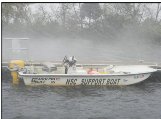
Horizontal Snow — October — 2011