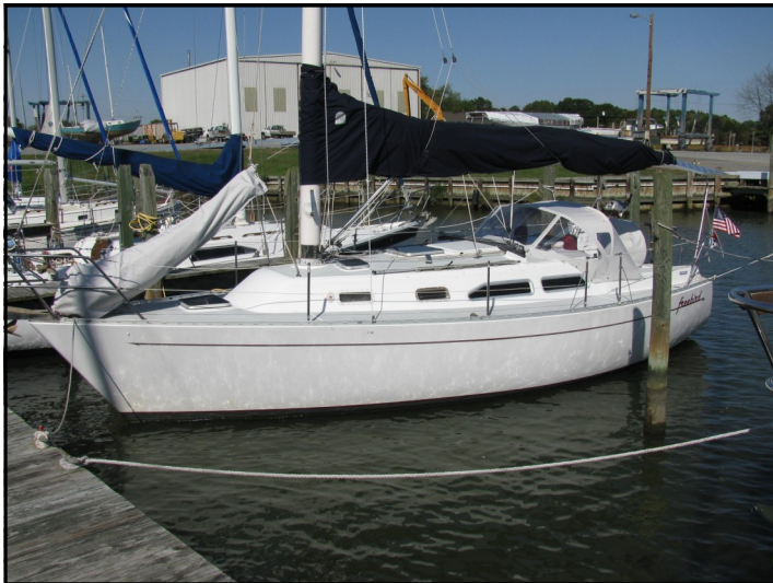
Bob Weeks— 1987 Freedom 30— Freebird