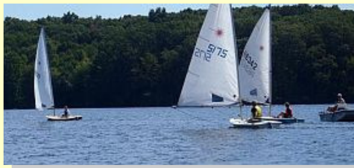
Young racers in the NSC Junior Regatta