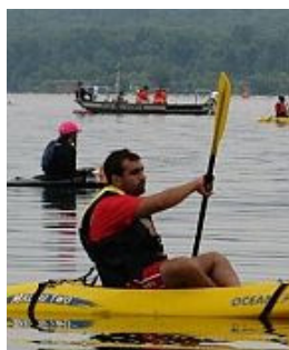
NSC hosts the Steelman Triathlon