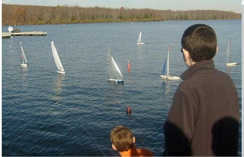
The Victoria fleet attracts skippers of all ages.