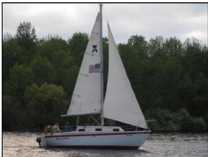
Sails and flags flying on Going Straight