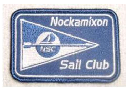
NSC Patches—3"W by 2"H, Add one to your hat, shirt or jacket $2.00 ea. or 6 for $10.00