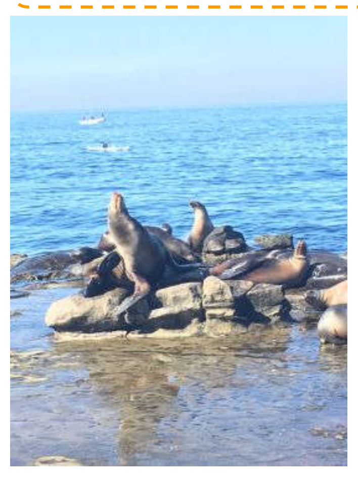
The crowd reacts to a close Thistle Midwinters finish