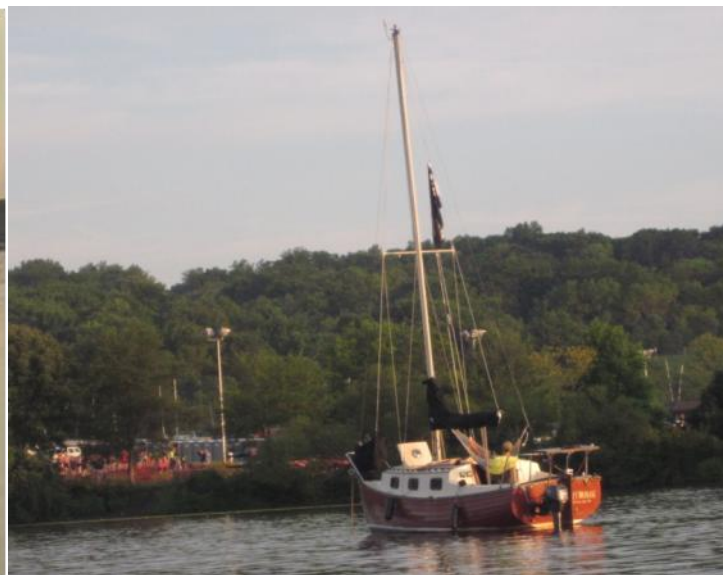
Theo in his hammock - sweet gig

Racers left the shore in continuous heats of about 100 people each; all those arms hitting the water in the quiet of the early morning is truly inspiring. The major task for the NSC boats was to “watch the caps” and make sure no one was steering off course (a few seemed to be planning to do the swim version of the ULDB) or in trouble. If someone appeared to be having difficulty, we alerted the kayakers to check up close that the swimmer was alright. It was great teamwork, and the entire swim event was pleasantly uneventful.