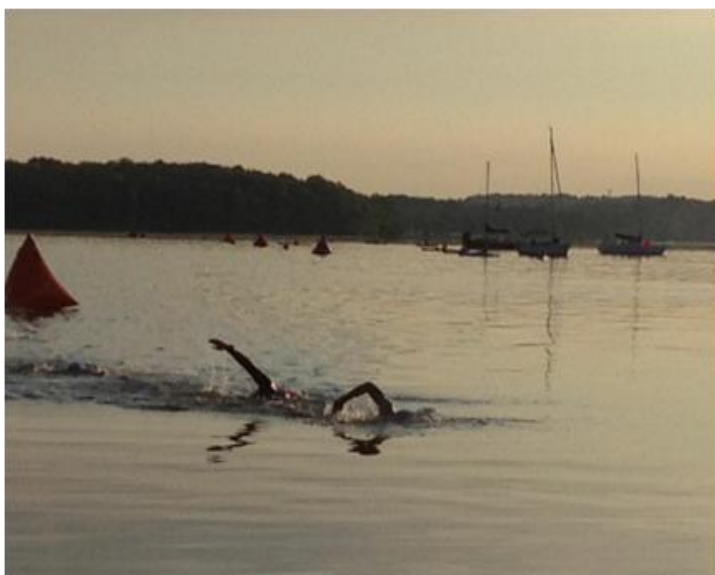
First swimmer to the first turn