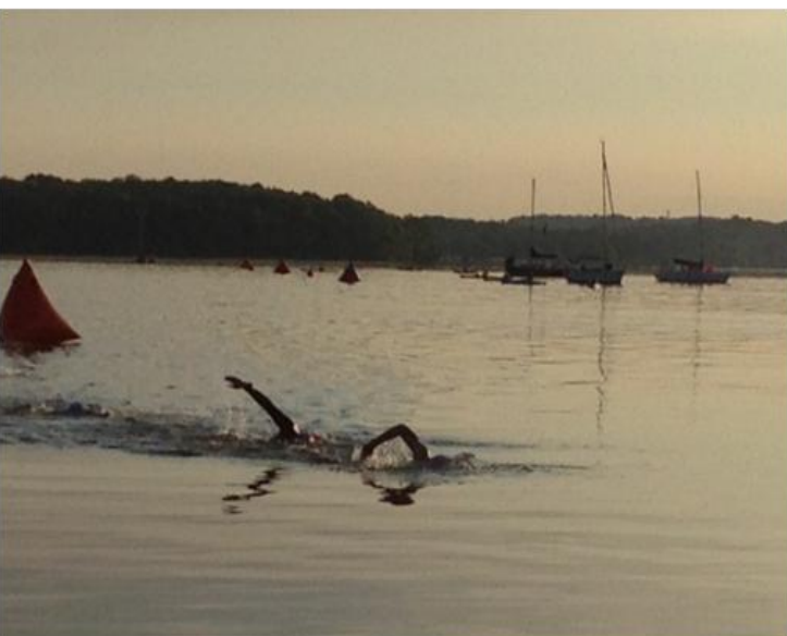
NSC boats show the way!