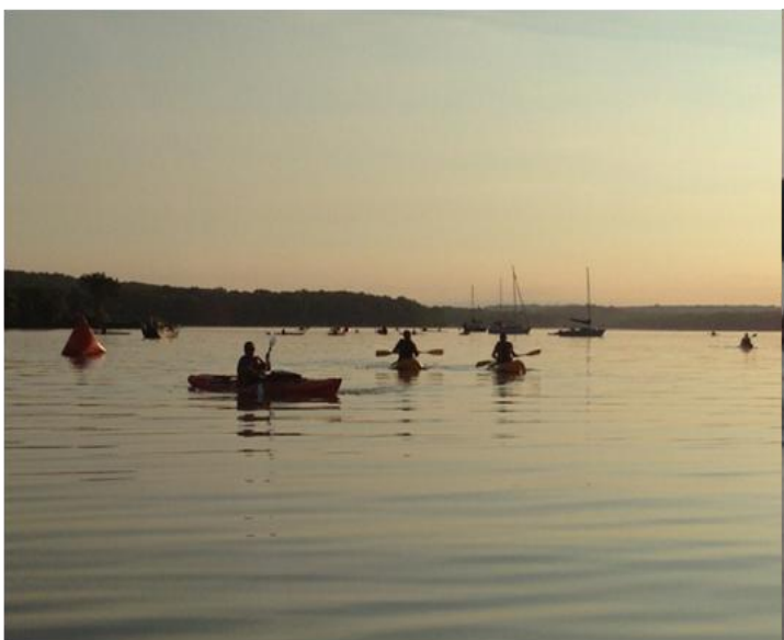
Lots of on-water support!

Best part of all? After the swim finished at 9:00, a few of us sailors raised the hook, hoisted the sails and headed out on the lake – not much wind, but having the entire lake to ourselves for a few hours was the perfect end to a well-spent morning. Come out and join us next August!