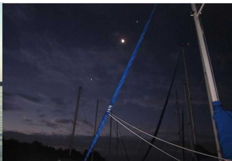
5AM - Waking up in the marina

The 9 th annual Steelman Triathlon was held at Lake Nockamixon to help the Make a Wish Foundation grant the wishes of children with life-threatening medical conditions to enrich their lives with hope, strength and joy.