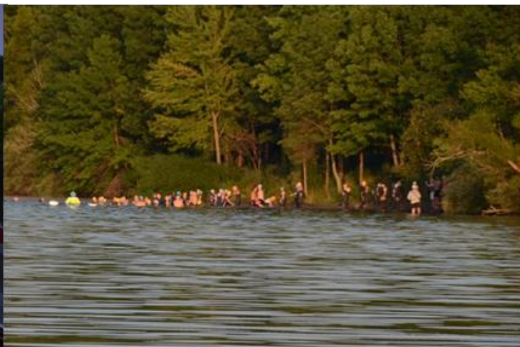
5:40 AM – NSC crews - instructions, shirts, and a donut – let's get out on the water!