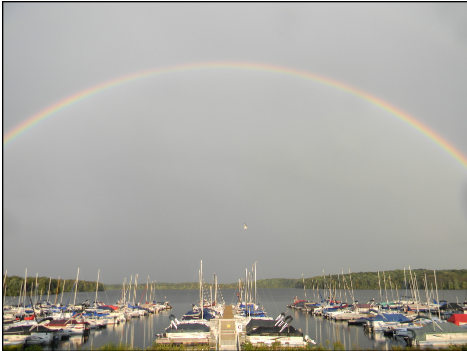
Seagull Flying Under a Rainbow at Lake Nockamixon September 29, 2011