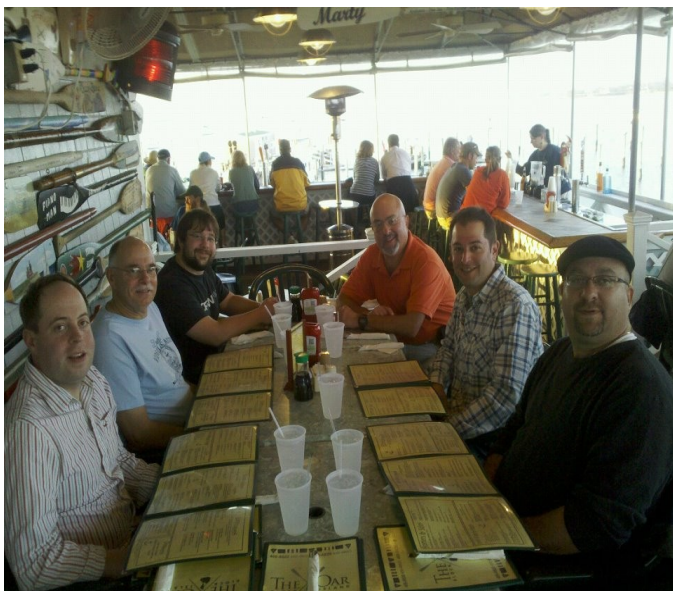
At The Oar Restaurant , Block Island

After taking showers at the shore facilities, we enjoyed dinner at The Oar Restaurant and the Finn's Seafood Restaurant, both of which had great ocean views. Saturday was partly cloudy with light winds. The day became sunny and quite warm. Some boats decided to do some blue water sailing and the other boats enjoyed the scenery, restaurants, shops and friendly people on Block Island. Some bicycled or motor biked around the island and then many of us wound up celebrating Octoberfest at the Po People's Pub.