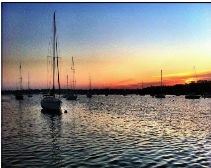
Saturday at Dawn From "Endless Dawn", Block Is.

Sunday began partly cloudy as we got an early start for the return trip. It turned out to be our best sailing day with favorable winds and reasonable seas for much of the trip. There were rain squalls all around us but we were lucky and had no rain. As we motored back into beautiful Newport Harbor the sun came out. We witnessed many sailboats of all shapes and sizes sailing and racing around the busy harbor. Unfortunately, due to the long ride home, we had to leave this wonderful place.