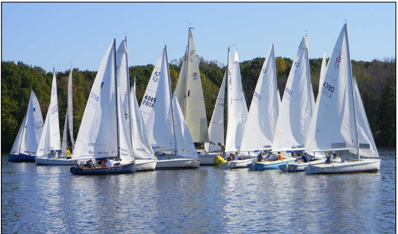
NSC Hosts the Flying Scot Challenge of the Lakes in very light winds on October 9 ! Is there any room at this Mark ??