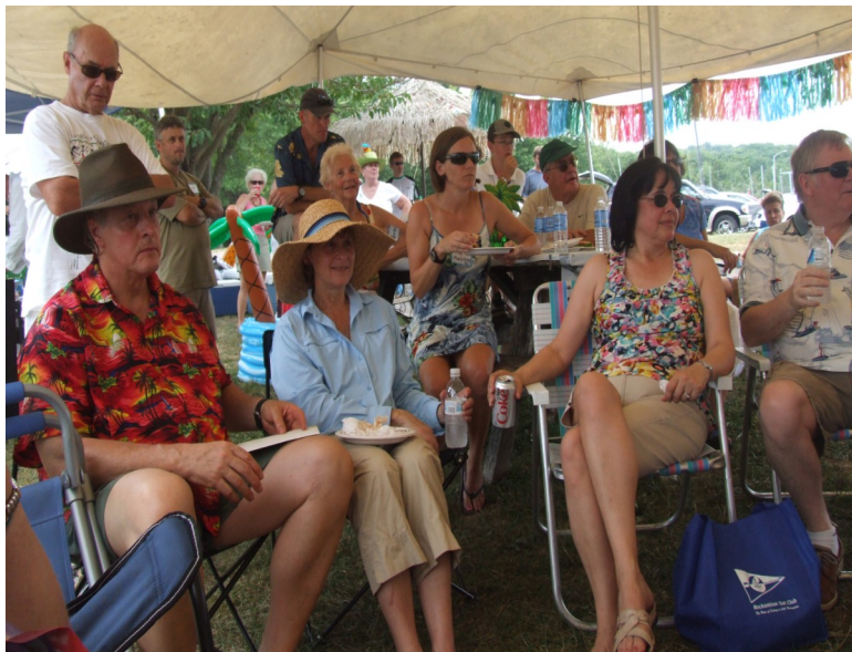
Tent Full of Sailors at ULDB Race Event