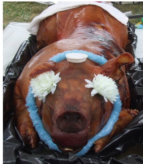
The "Guest of Honor"