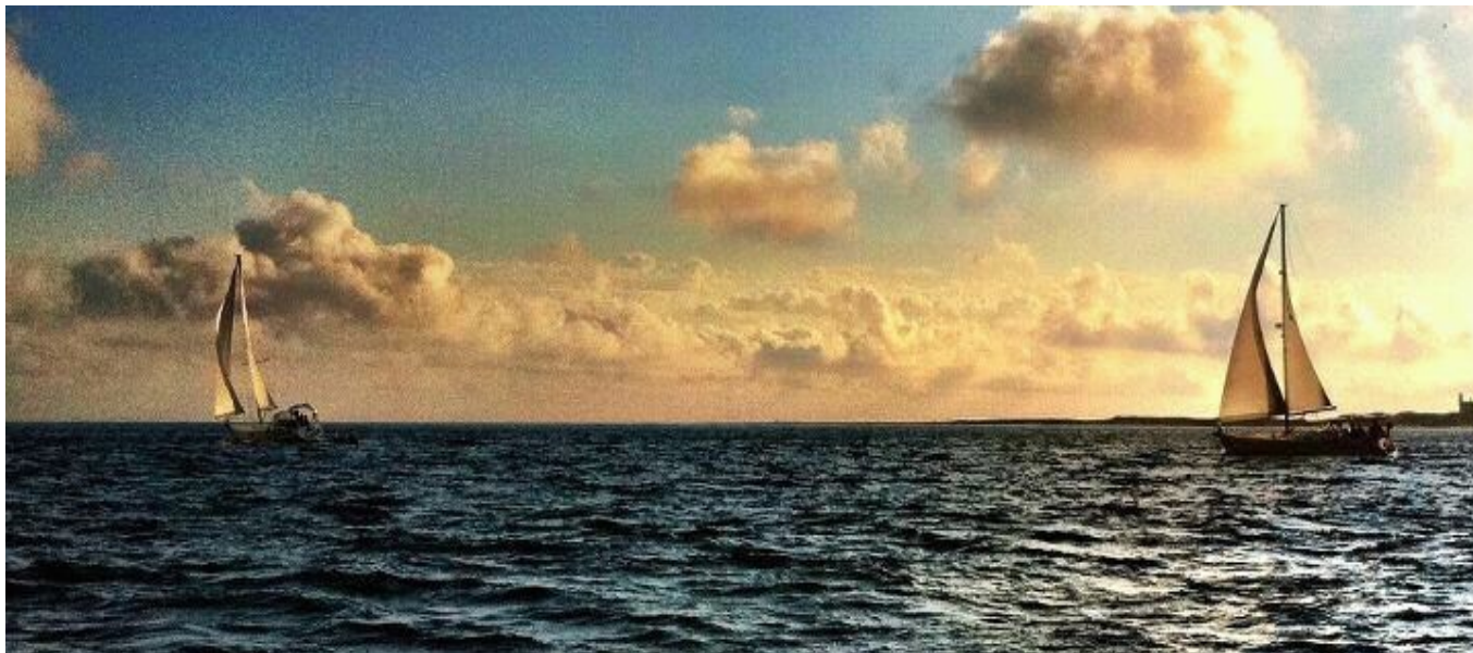
Sailing back to Newport on Sunday From Block Island