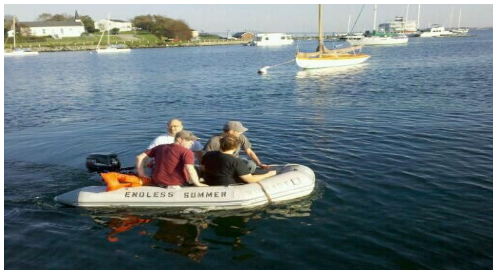
The Men's Dingy

We all arrived at Fort Adams State Park in Newport on Thursday afternoon. Our four Beneteau 42' boats were on mooring balls in the harbor next to this historic site. We had to use a launch service to take our luggage and supplies to each boat. We also took the dinghies for each boat from the dock out to the boats. This all got complicated as a large area of heavy rain moved in during our transition to the boats. Upon arriving at our boats we found the charter company had left all the hatches open which allowed the rain to get the boat interiors, including the bunks. WET!!!