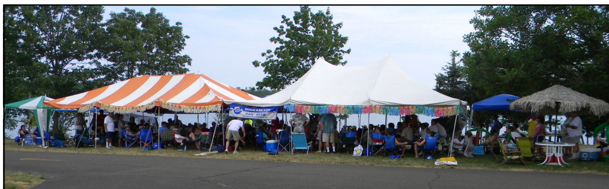
ULDB Article Written by Craig Tourtellott for the Bucks County News Herald

On Saturday, Nockamixon Sail Club (NSC) hosted its annual Up-the-Lake Down-and-Back (ULDB) Regatta and Picnic. The local sailing club with over 100 members from the local area runs the event. This is the 20th anniversary running of the event. The heat this weekend made the event one of the warmest in the event's history. Skippers and crew onboard the racing sloops provide visitors to the lake a view of sailboats and white sails from shore to shore. A few of the boats displayed their bright colored spinnaker sails downwind adding a perfect backdrop for photos of the events. The club also hosted a pig roast afterwards with sailing awards to the top skippers in the racing and cruising classes.