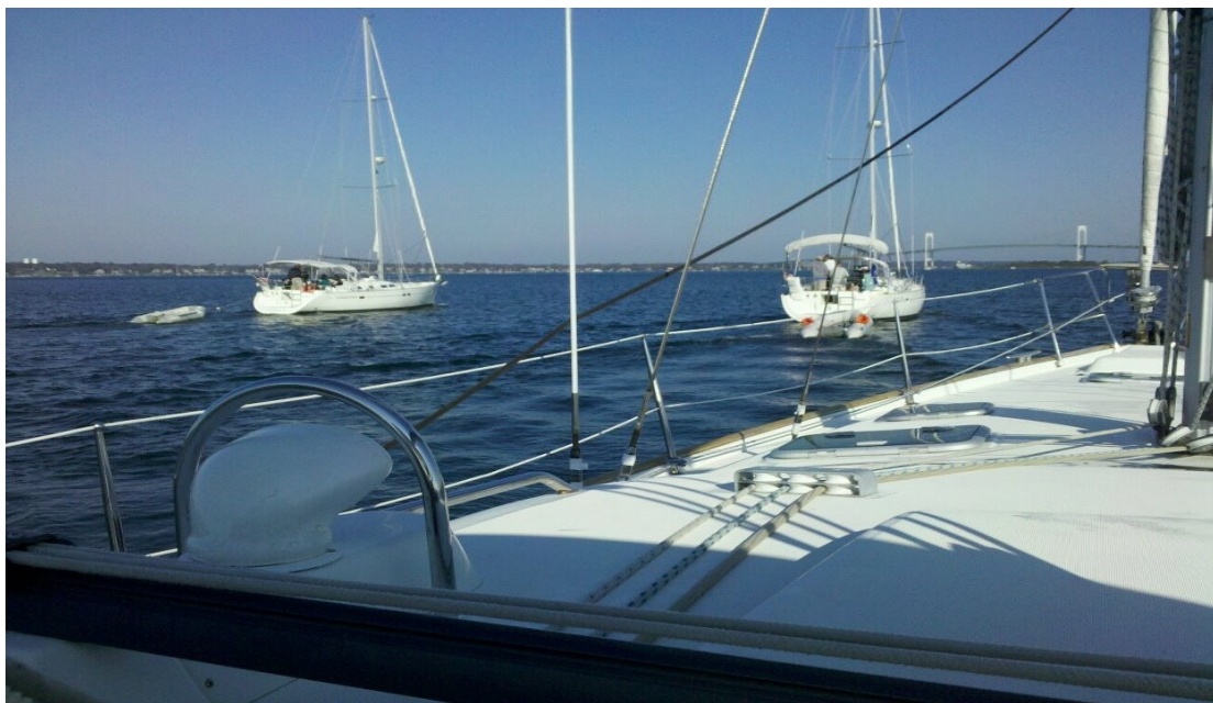
Motoring Out of Newport