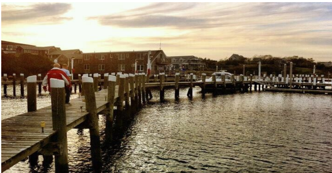
Champlin's Marina Resort @ Block Island

While we unpacked and dried things out as best we could, the rain went away to leave us with a beautiful sunset in a scenic setting. Friday morning was partly cloudy with an increasing breeze as we set out for our sail to Block Island. This trip was a bit challenging as the winds built up to 17 to 28 MPH and we had several hours of 6 – 8 foot swells. We arrived at BI in late afternoon and everyone was happy to motor into the serenity of the Great Salt Pond where Champlin's Marina and Resort Hotel was located. Everyone had a successful docking experience in our home away from Lake Nockamixon. Overall our sailboats handled this trip well, but each of the four boats had at least one sea sick crew member.