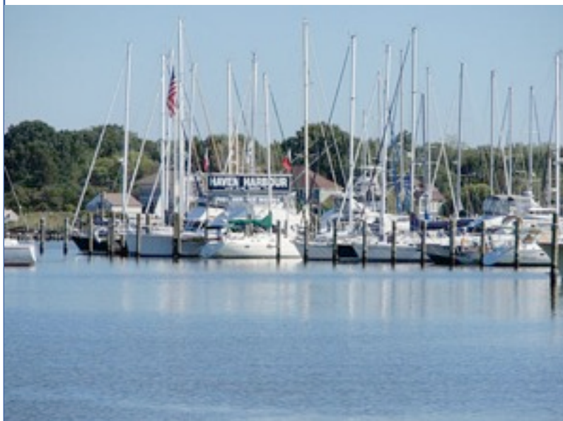
Haven Harbor, Rock Hall, MD