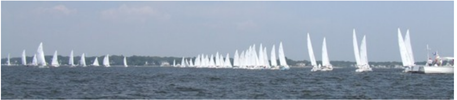
The Championship Fleet Starts as the Challengers watch the action at the 2008 NAC's.