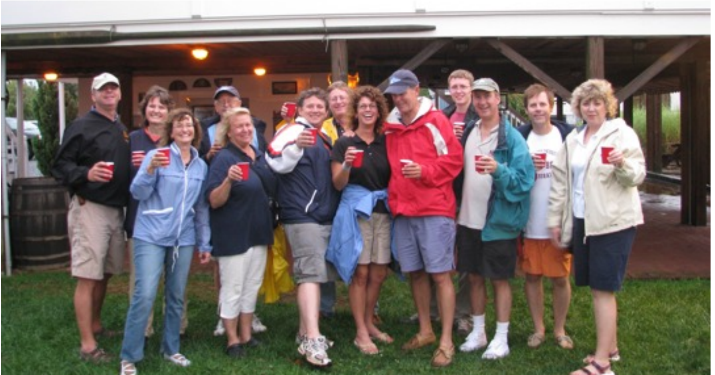
NSC Cruising Fleet enjoys the Blue Margarita Party at Rock Hall, Maryland on the September Chesapeake Cruise.